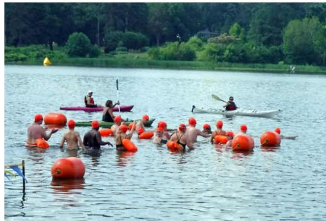
Athletes Without Limits 1k start (formerly the Nautical Milers)